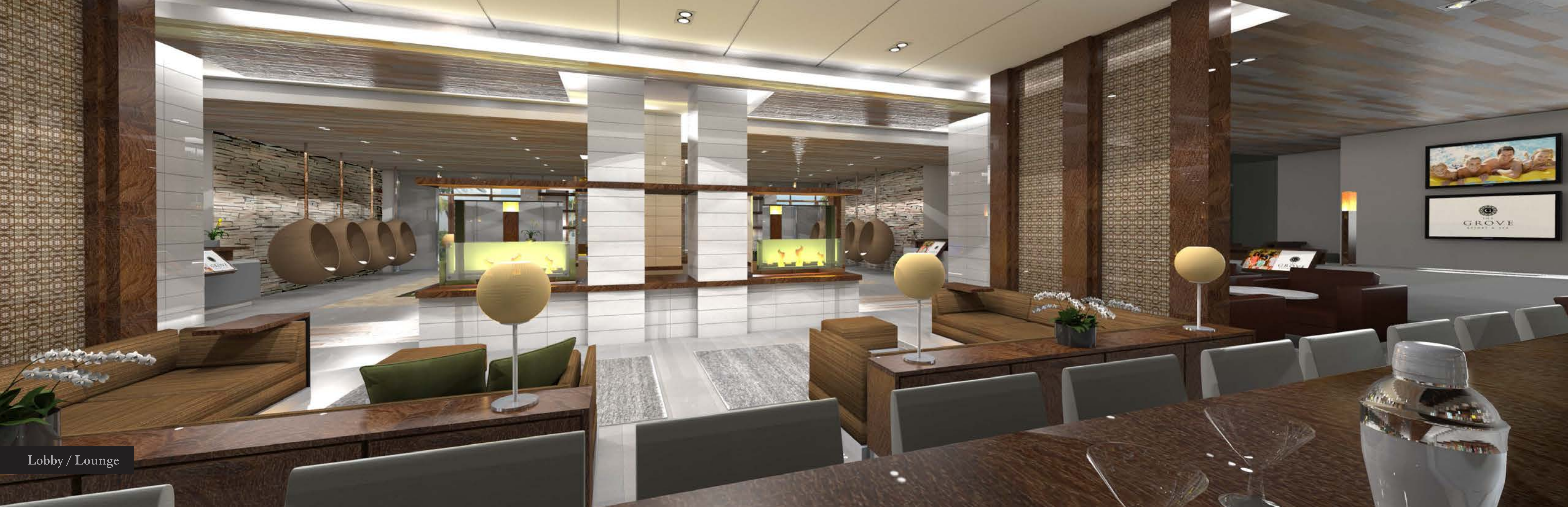
Lobby / Lounge