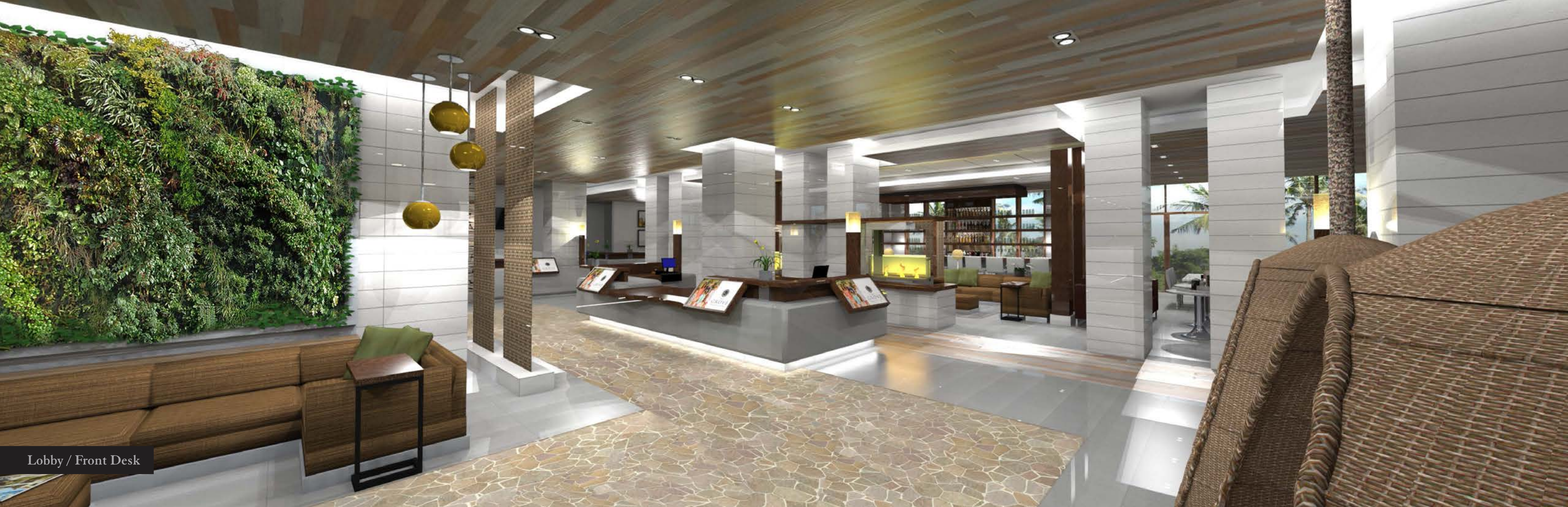
Lobby / Front Desk