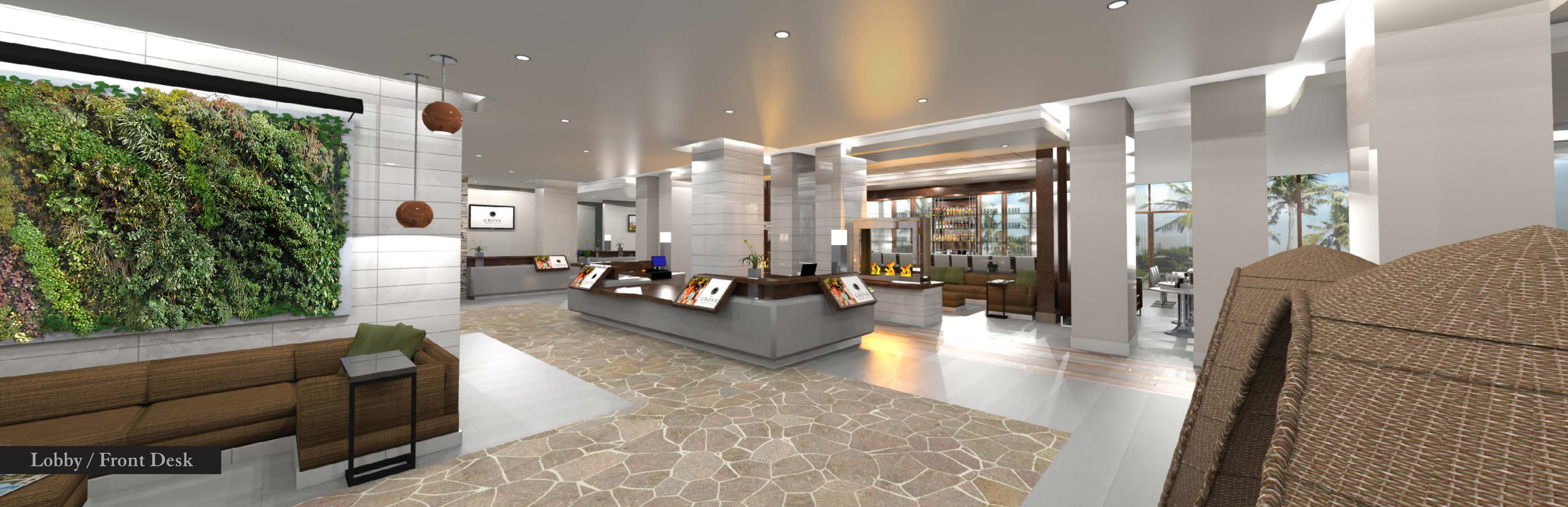
Lobby / Front Desk