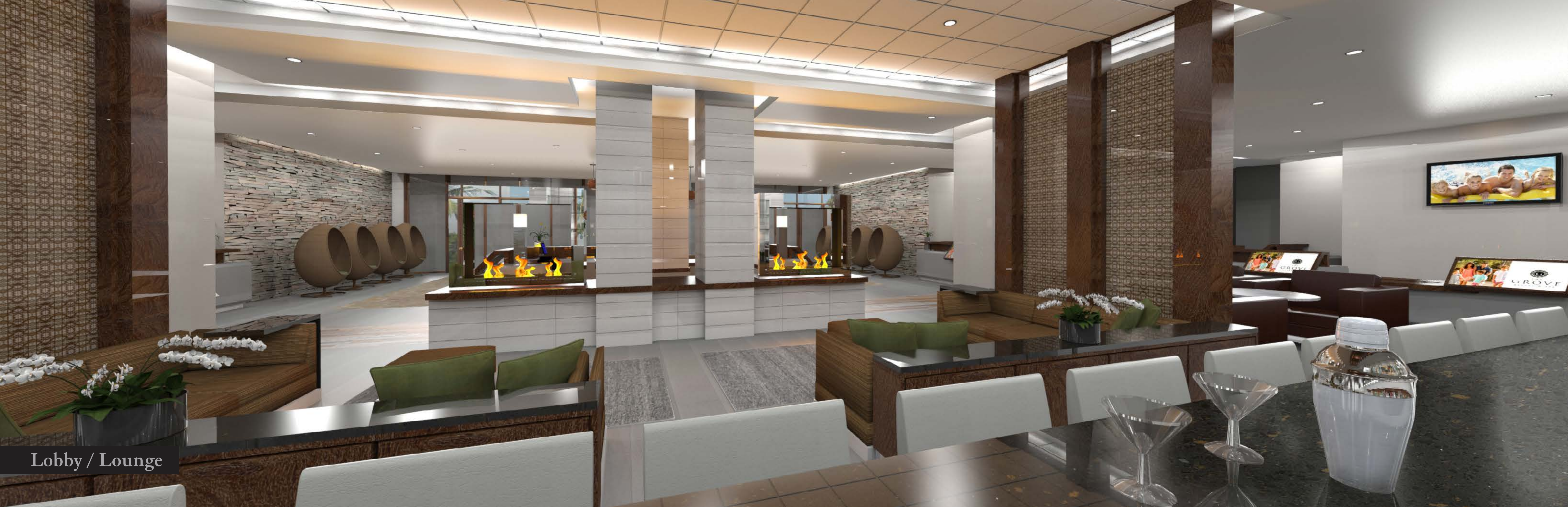
Lobby / Lounge